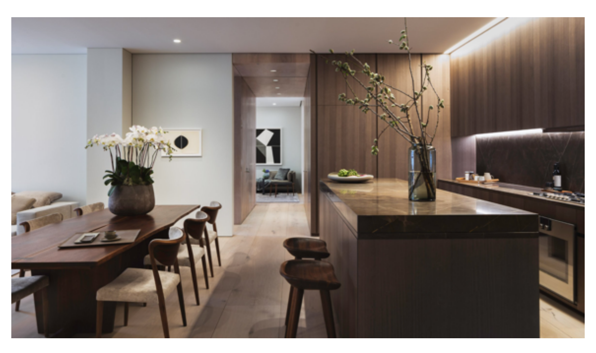
By Dan Howarth May 11, 2017

A model residence has been completed inside Tadao Ando's apartment block in New York, offering a glimpse inside the Japanese architect's first residential building outside Asia.